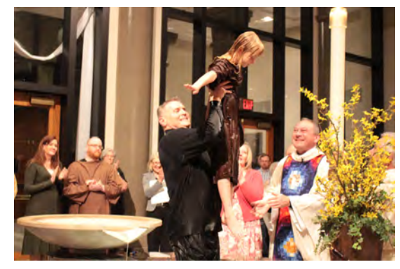
One of 12 baptized during Easter Vigil 2023.

Adults (RCIA), and are received into the Catholic Church at the Easter Vigil on Holy Saturday. In this case, they would have been going through instructions on our faith throughout the previous year, and then immediately after making their profession of faith, they would be Confirmed and receive their First Communion, also at the Easter Vigil.