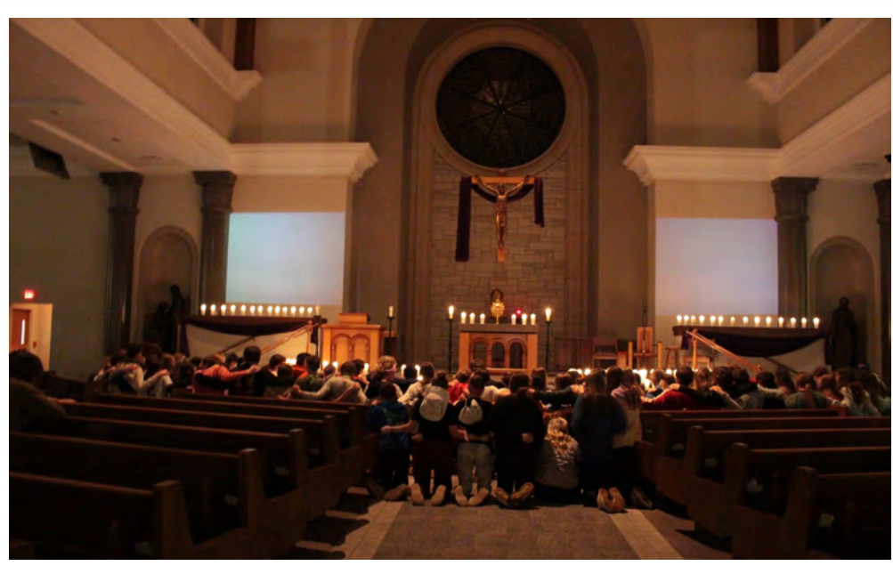
Eighth graders gather for Eucharistic Adoration during our annual Luke 18 Retreat.

Life Teen, our high school ministry, begins with the 5:30 p.m. Sunday Life Teen Mass, and then meets from 6:30 p.m. – 8:45 p.m., always starting with a meal, and then moving into session that breaks down our Catholic faith in a way that is