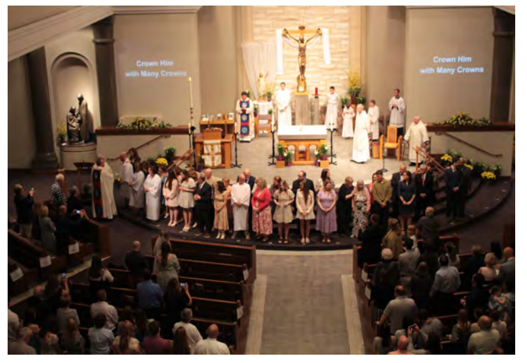
Those who have already been baptized in another Christian Church are being received into full communion with the Church.

You might hear us use the word evangelize at times, and we find it in these professions of faith. When we evangelize we have found the good news in Jesus Christ so we want to bring it to others so they may also have it and bring them to Him.