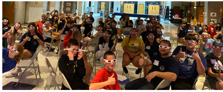
Middle schoolers at Assumption Edge enjoy exciting 3-D activities.

Edge, our middle school ministry, is offered in tandem with PSR and serves as dynamic faith formation in a youth ministry setting, preparing 7th and 8th grade youth to receive their Confirmation. All 7th grade and 8th grade youth are welcome, both Assumption school and public-school students. Students meet in grade-specific small groups that remain consistent throughout the year to facilitate holy friendships and trust, as well as mentoring relationships with adults and teen core members who lead the small group. Each Edge session is dynamic, prayerful, educational, and fun.