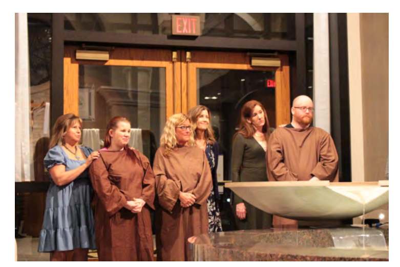
Those being baptized and their sponsors gather at the baptismal font.

For those coming into the Catholic Church that were not baptized, that is obvious, since they have not known Christ. For other Christians who have already been baptized but are not Catholic, we believe the fullness of Christ, the sacraments, and how Christ meant us to be united. Life is found in the Catholic Church; Christ is our head, and we are his body. We do not deny the relationship other Christians already have with Christ, that is why we believe in their baptisms and do not re-baptize people coming to the Catholic Church from other Christian denominations. But we do have a process to receive them into the Catholic Church, to be sure they understand what they are doing and are open to the obligations, the rights, and all the graces God offers us in the sacraments.