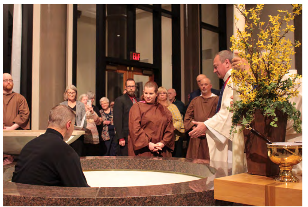
Candidates are welcomed into the baptismal font one at a time to be baptized.