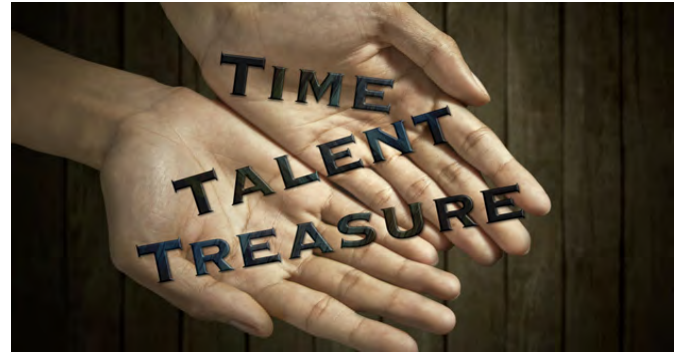
Using Our Gifts of Time, Talent and Treasure