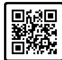
Table and ticket purchases as well as Sponsorships are still available. Scan the QR code for more information. We look forward to seeing you this year!

Back by popular demand: Kids dress down passes and Ditch Day opportunities (on sale starting February 7)